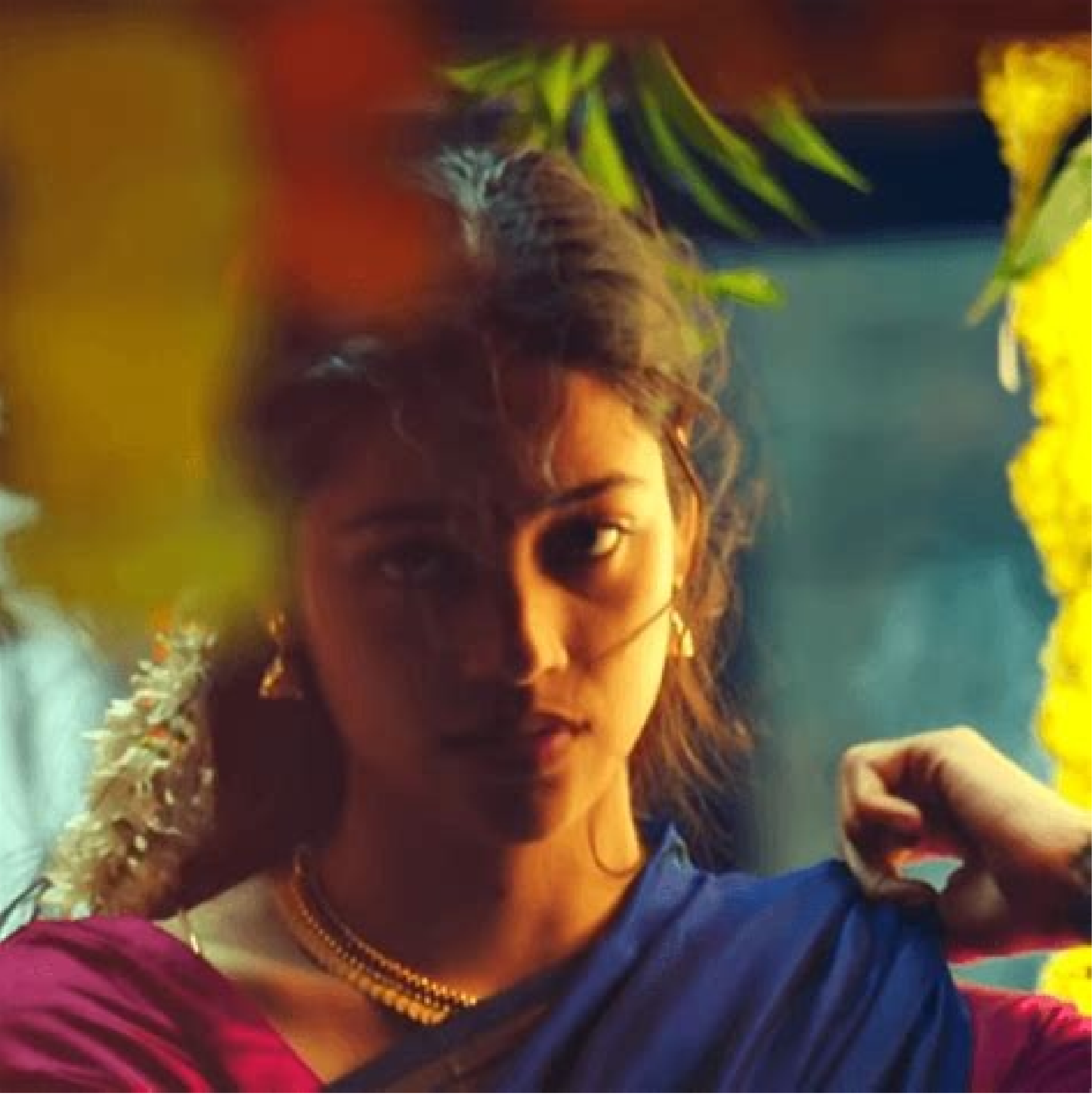
Saaho tamil video songs download.